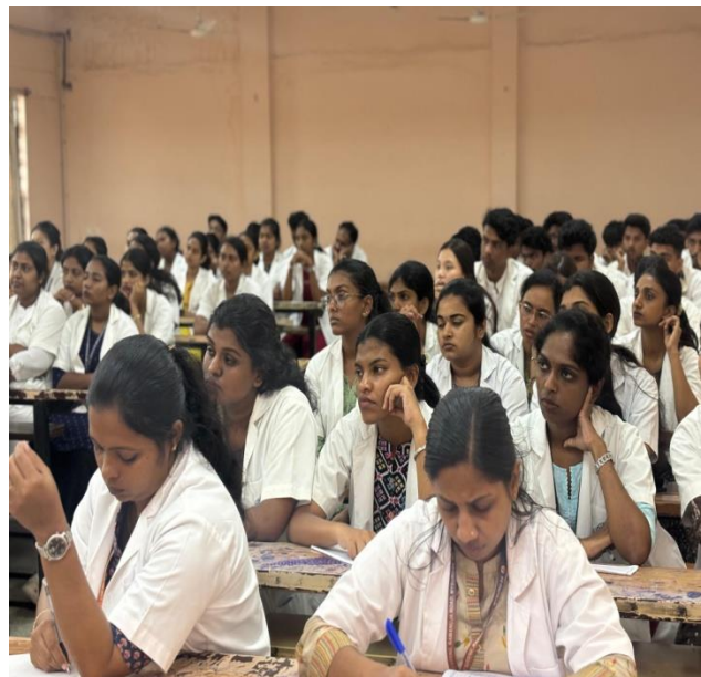
BSc and MSc students participated in culture