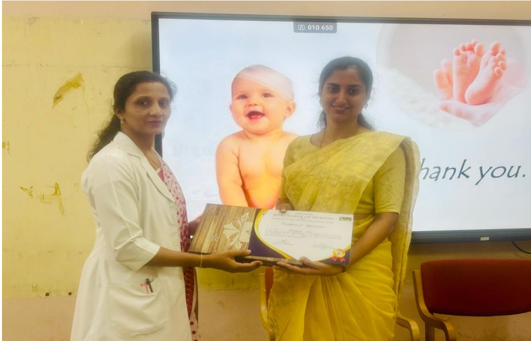
Handing over certificate and token of gratitude to guest